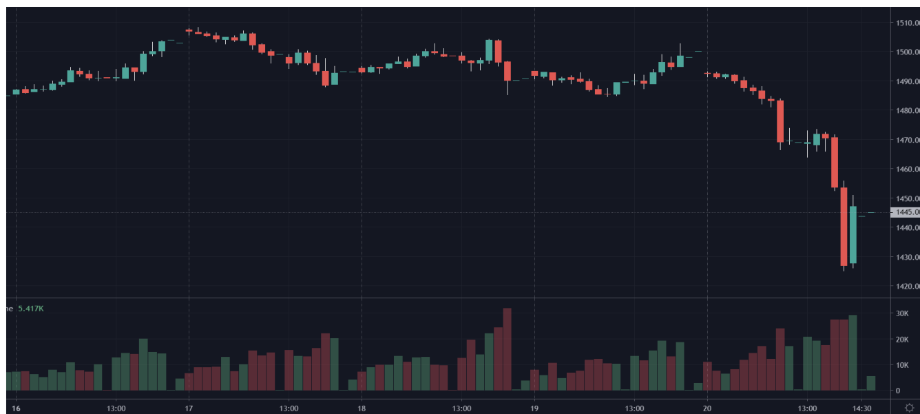
VN30F1M, 15m-chart, 1 week

With both the VN30 and the F1M contract closing below both the 50-day MA support line, we think the VN30 will be able to continue to decline in the short term in the coming sessions. VN30's 1410-1425 support zone is the closest area to keep VN30's recovery momentum from the end of July.