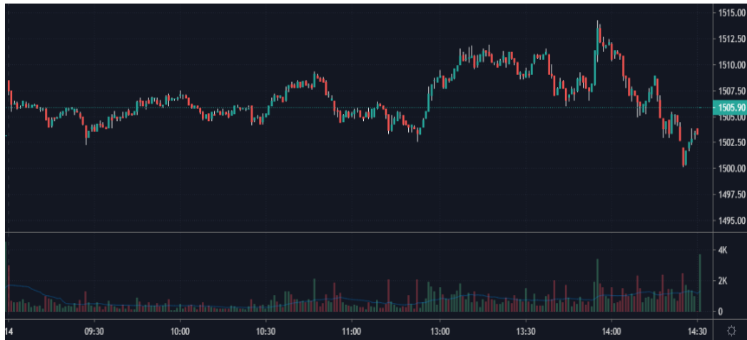
VN30F1M intraday.