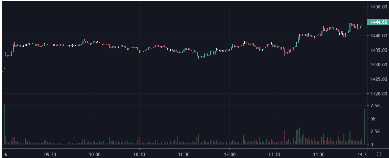
VN30F1M intraday.

The VN30 index had a rather positive recovery session when it closed above the 100-day MA with the group's liquidity gradually returning closer to the previous 20-day average. In the short term, the VN30 is in a recovering and accumulating trend. Liquidity and volume are gradually improving but still need a few more sessions above the 20-session average to minimize the short-term correction risk. Currently, the resistance area of 1450 needs to be overcome for VN30 to confirm the short-term uptrend. After creating a bottom and recovering from 1390, this is temporarily considered the closest support for the index in this short-term rally.